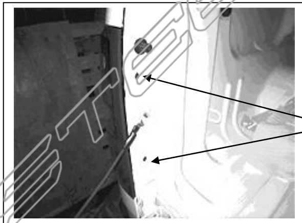
FIG. 1 DRIVER SIDE

PHILLIPS HEAD SCREWS, REMOVE AND SET ASIDE