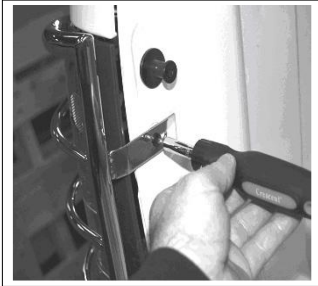
FIG. 3 Stock taillight mounting screws reinstall through inside brackets.