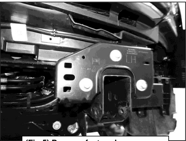
(Fig 5) Remove factory bumper brackets and tow hooks if equipped