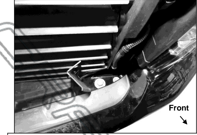
(Fig 4) Pull back cover to locate top bumper bolts

WARNING! Do not crawl under bumper unless it is properly supported on blocks or stands or the bumper may fall.