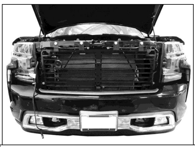
(Fig 2) Firmly pull grille straight out from vehicle