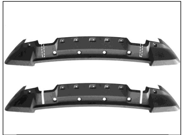
(Fig 21) Cut slots to clear the Brackets (dashed line for example only )